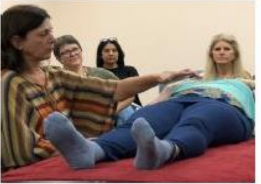
How lovely to have a small but intimate class. It was a perfect size for the room and the material. And everyone was mesmerized by the power of the process!